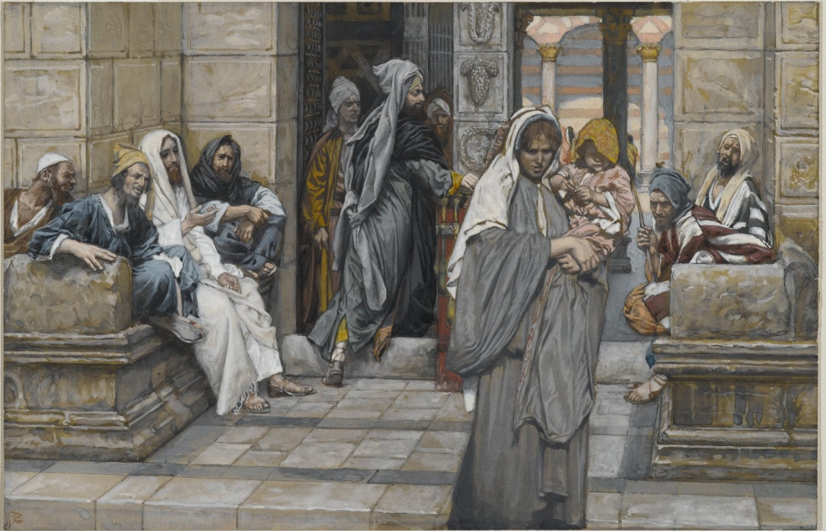
The Widow's Mite

November 10, 2024, 8:00 and 10:30 am Worship Services