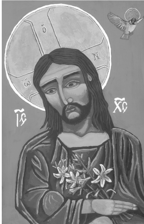
Christ: Consider the Lilies

A sermon or meditation may follow the Gospel.