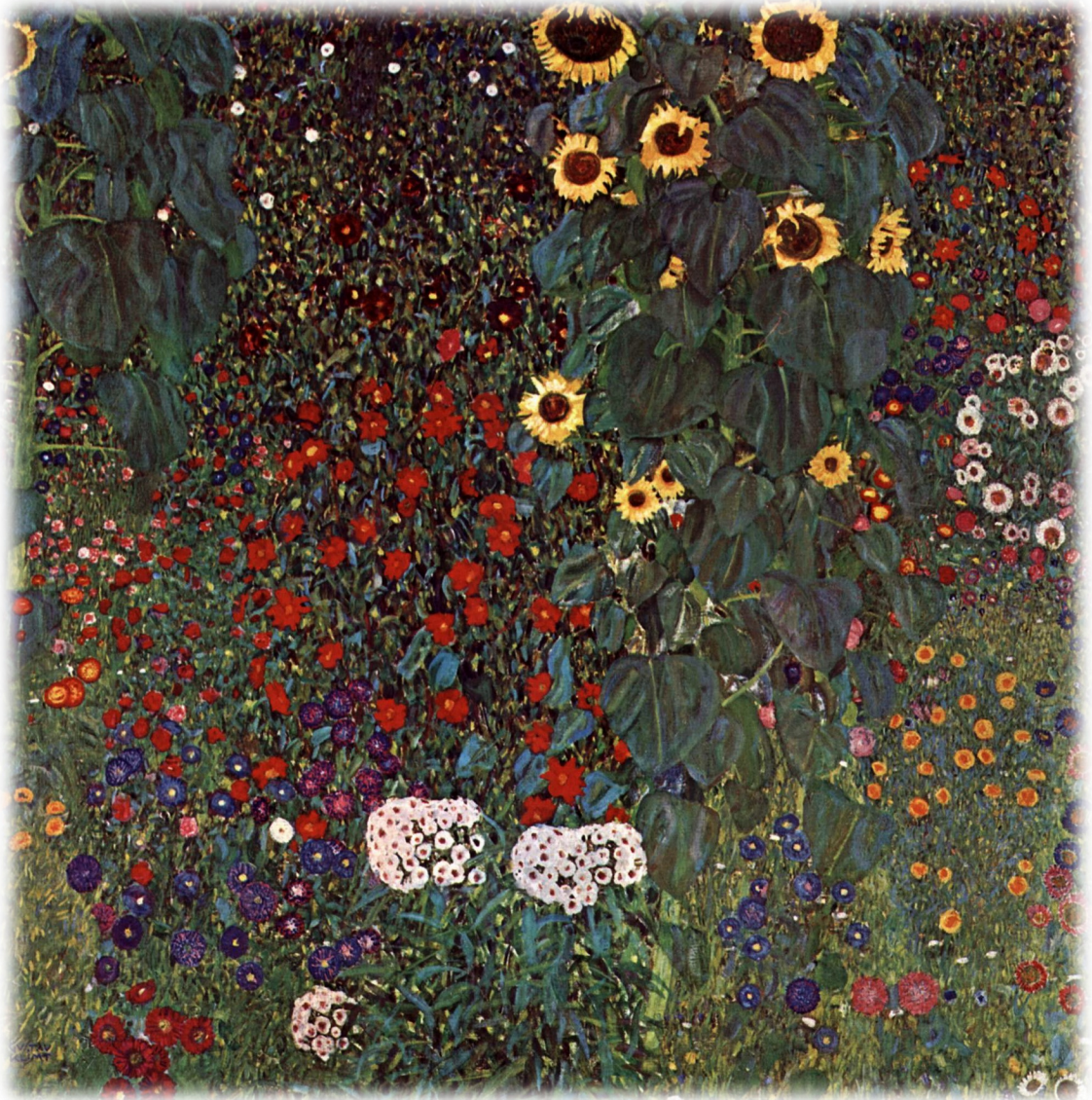
Garden with Sunflowers